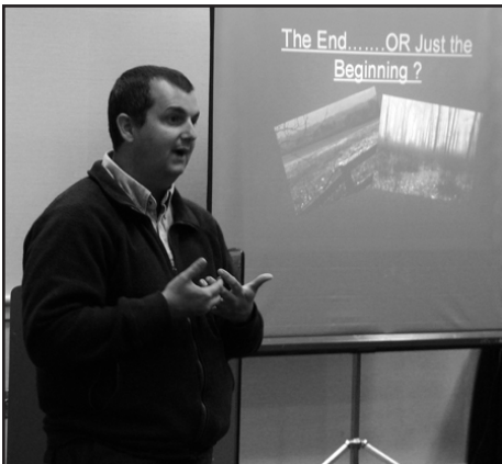
Brad Isles Photos