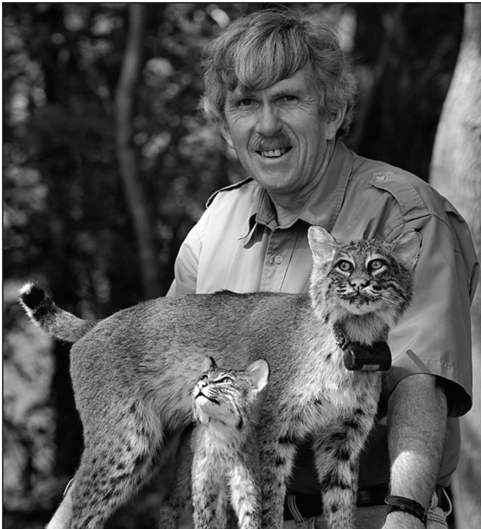
Don Carey Photo